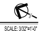
PROPOSED QUARTERMASTER FLOOR PLAN - 7,200 Sq. Ft. 5051 RESOURCE CONNECTION