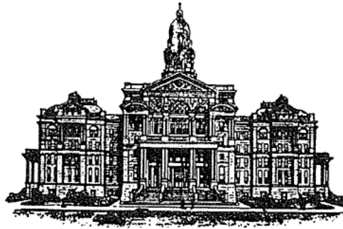
Tarrant County 1895 Courthouse